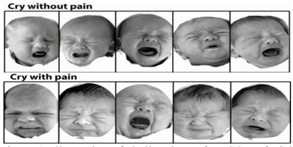
Figure 1. Illustration of challenging Infant COPE facial images.

Photographs were taken of the infants at baseline rest and while experiencing several noxious stimuli: bodily disturbance, an air stimulus on the nose, friction on the external lateral surface of the heel, and the pain of a heel stick. The goal of the Infant COPE study design was to obtain a representative and challenging set of facial images for classification experiments. Figure 1 illustrates some of the challenges presented by the images. This figure compares crying images that were triggered by a nonpain stimulus with crying images that were triggered by the pain stimulus.